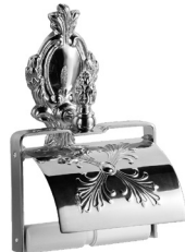
Accessori - Imperiale - AAIM07