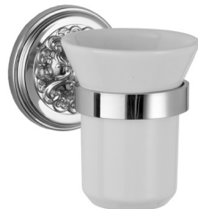
Accessori - Lexington - AMLE00