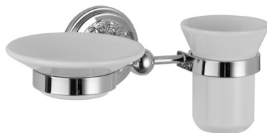
Accessori - Lexington - AMLE04