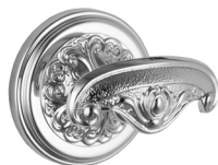
Accessori - Lexington - AMLE06