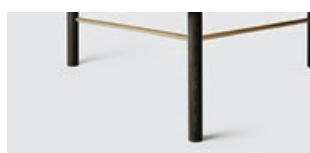
BLACK ASH / BRASS