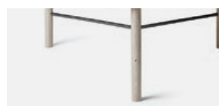
WHITE OAK / BLACK CHROME