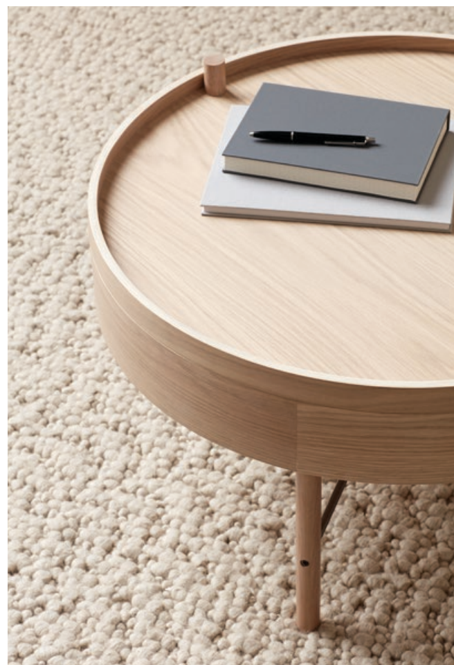
Turning Table, White Oak / Black Chrome / White Oak, by Theresa Rand Gravel Rug, Ivory, by Nina Bruun