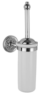
Accessori - Lexington - AMLE12