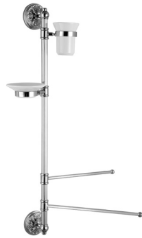
Accessori - Lexington - AMLE16