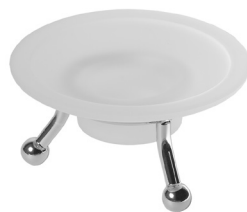
Accessori - Regent - AMRG03