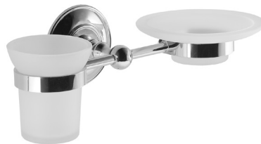
Accessori - Regent - AMRG04