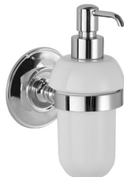
Accessori - Regent - AMRG05