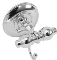
Accessori - Regent - AMRG06