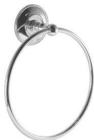
Accessori - Regent - AMRG08