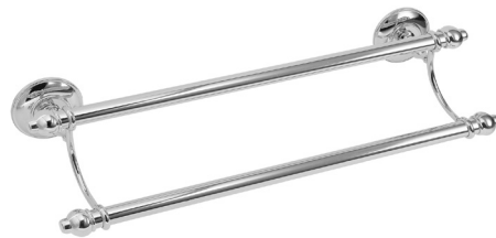
Accessori - Regent - AMRG11