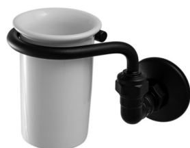
Accessori - Tubo' - AMTU00