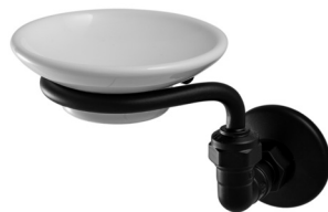
Accessori - Tubo' - AMTU02