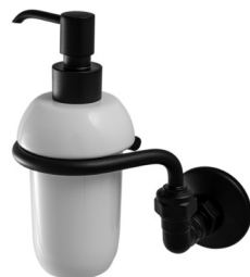
Accessori - Tubo' - AMTU05