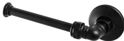
Accessori - Tubo' - AMTU07