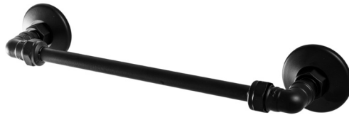
Accessori - Tubo' - AMTU09