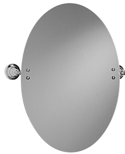
Accessori - Lincoln - AMLN15