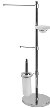
Accessori - Regent - AMRG13