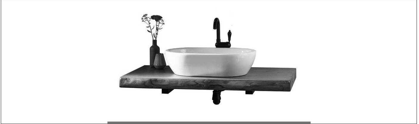
Industrial - Wood 3