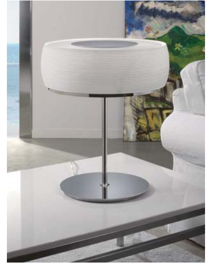
Table lamp with iron structure coated in shiny chrome or satin nickel coated finish. Lamp shade is opal crystal blown into a globe, with only the middle section being utilized. Opal crystal undergoes sand blast treatment, which lends an opaque, frosty appearance to the glass. Matte glass upper diffuser is included with the fixture, lower iron diffuser with chrome or nickel coating is also included. Consult sales team for possible dimming options. Only product finishing is customizable.