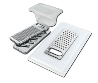
Graters kit with ring-holder and food collection tray 8159 101