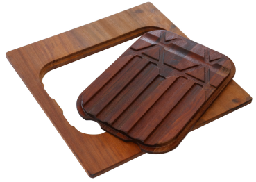
Iroko-wood twin chopping board 8644 004