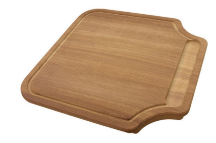
Iroko-wood chopping board 8646 000