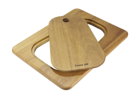
Iroko-wood sliding chopping board 8644 041