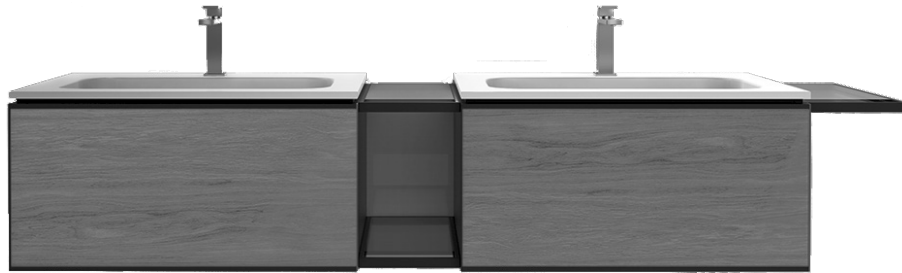
Studio - Poliedrica 3