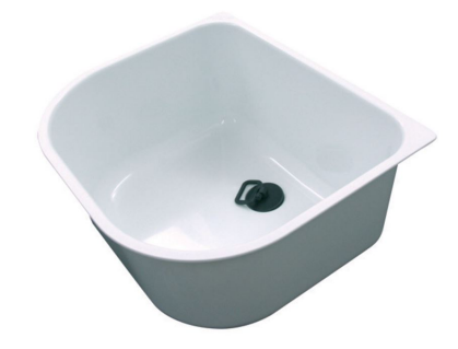
Vaschetta bianca 8152 100