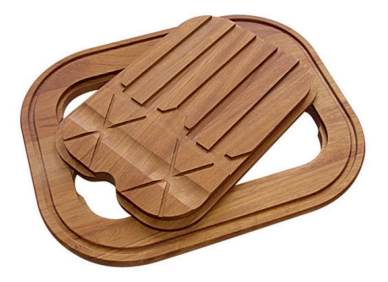
Iroko-wood twin chopping board 8644 003