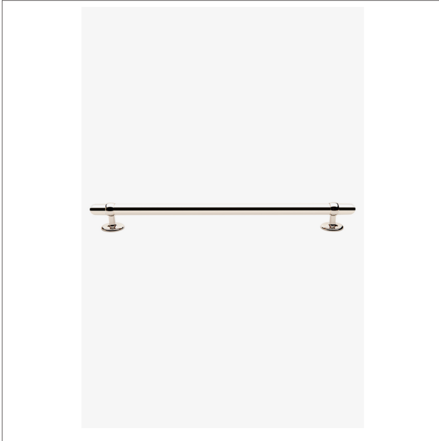
SHOWN IN STOCKTON 12" METAL PULL | SKHW13