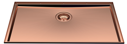
Sink Phantom Base Copper - 5557 148