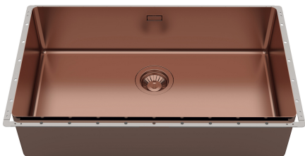
Sink Phantom Edge Copper - 4157 018