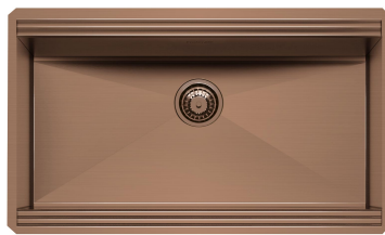
Sink Milanello Copper Workstation 1034 858