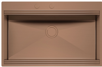
Sink Milanello Copper workstation 1034 058