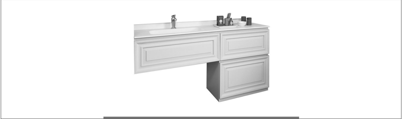
Contemporary - Scena