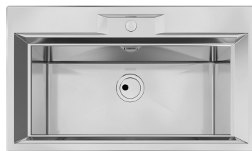
Sink FL 2976 060