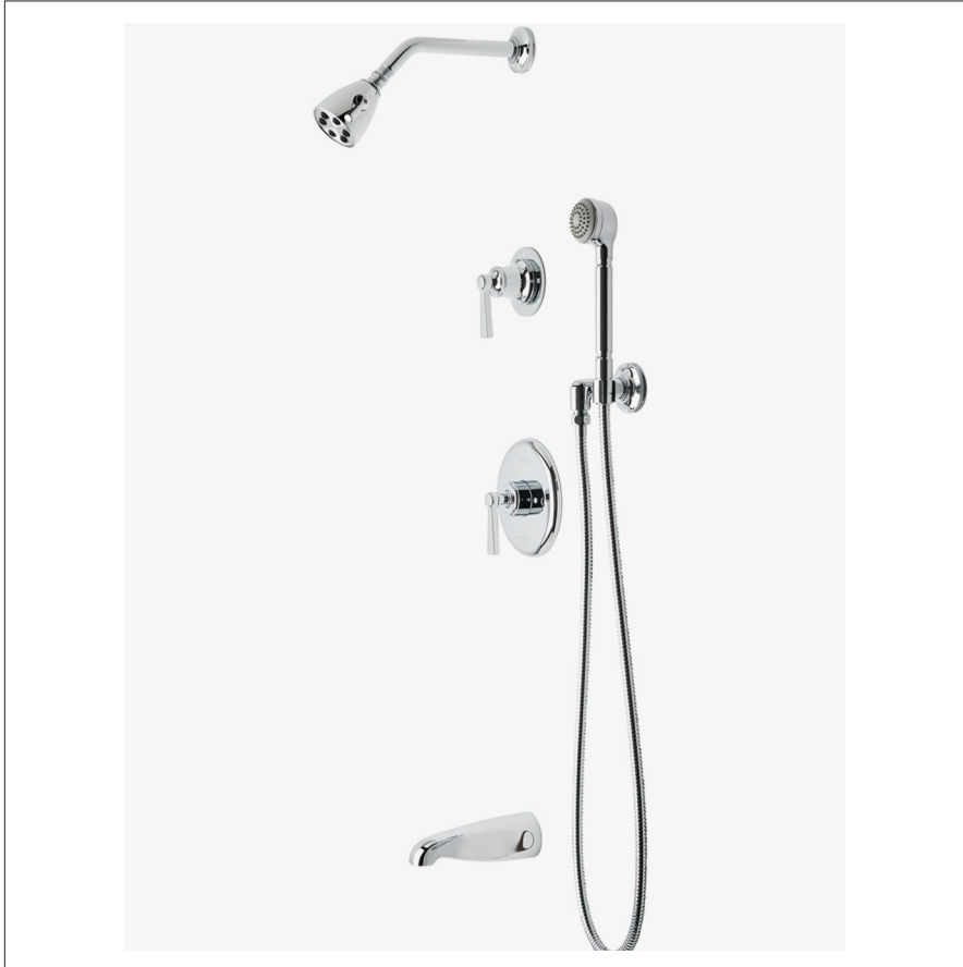
SHOWN IN TRANSIT PRESSURE BALANCE SHOWER PACKAGE WITH 2 3/4" HEAD, HANDSHOWER, TUB SPOUT AND

Transit Pressure Balance Shower Package with 2 3/4" Head, Handshower, Tub Spout and Diverter Lever Handle