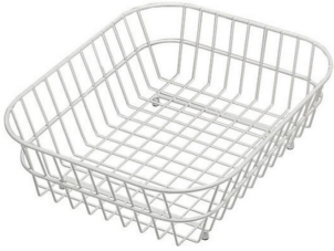
Cestello inox 8612 000