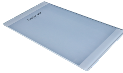
Glass chopping board 8631 300