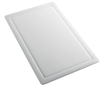
HPDE Chopping board 8657 001