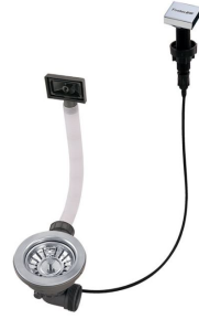
LIRA automatic waste fitting 8407 102