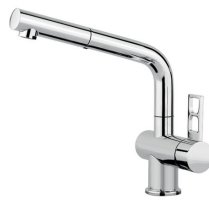
Mixer Tap Luisa 8482 000