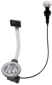
Automatic waste fitting 8407 000