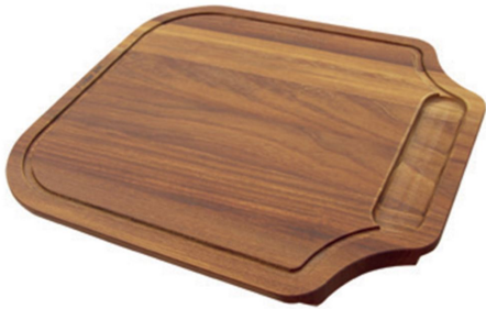
Iroko-wood chopping board 8655 000