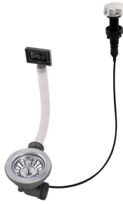
Automatic waste fitting 8407 100