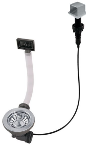
LIRA automatic waste fitting 8407 103