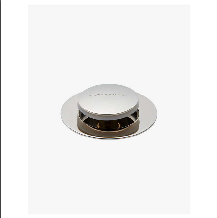
SHOWN IN UNIVERSAL USA PUSH-TOUCH LAVATORY DRAIN| UNLD17