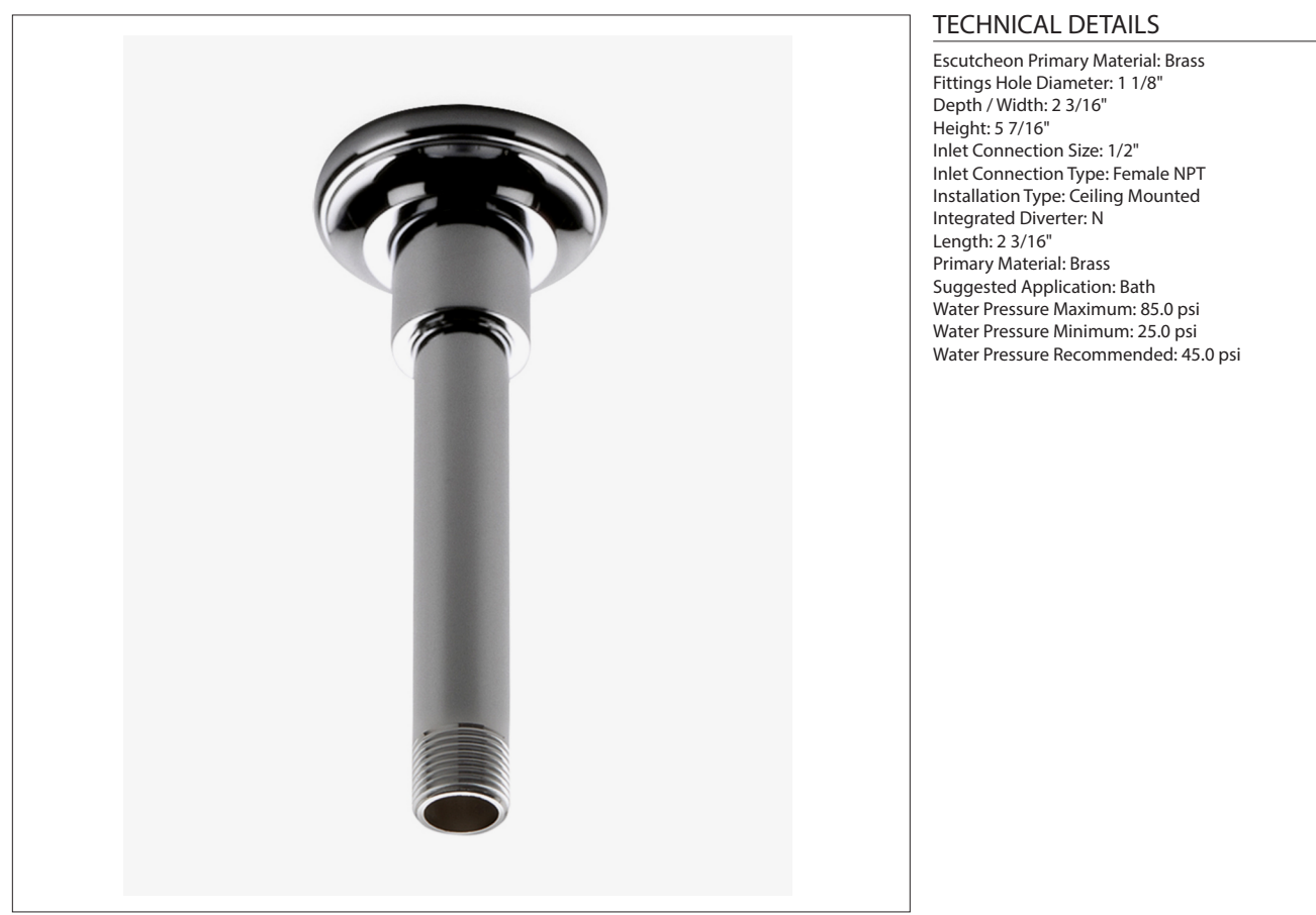
SHOWN IN UNIVERSAL VERTICAL SHOWER ARM AND FLANGE UNSH36