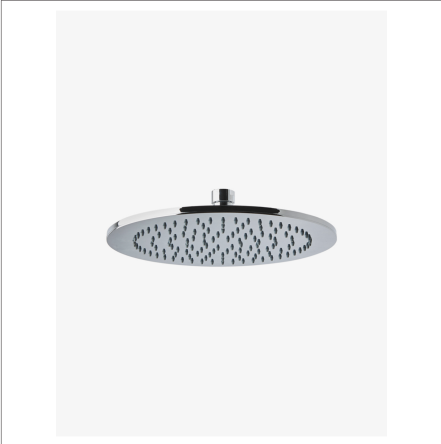
SHOWN IN UNIVERSAL ROUND FLAT 9 1/2" SHOWER HEAD | UNSH42