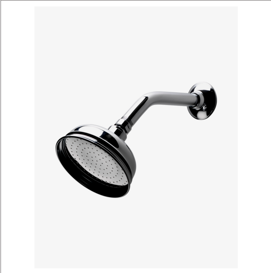
SHOWN IN UNIVERSAL SHOWER ARM AND FLANGE| UNSH90