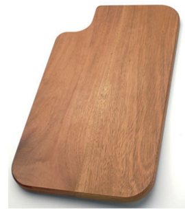
Iroko-wood chopping board 8643 115