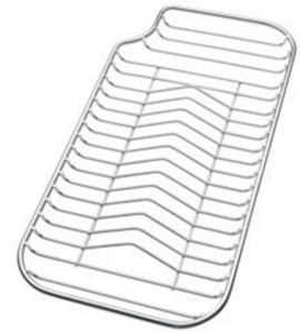
Stainless steel plate rack 8100 115