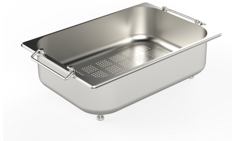
Stainless steel colander 8154 000