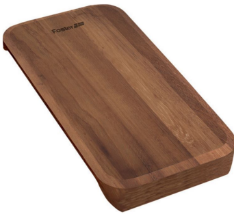
Iroko-wood sliding chopping board 8643 116