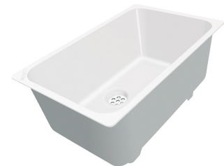
White bowl 8153 100