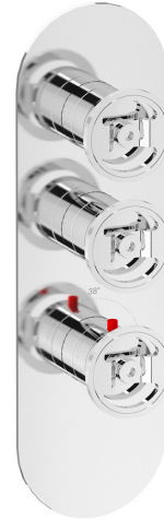
Plate and handles trimkit