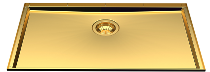
Sink Phantom Base Gold - 5557 149