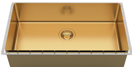
Sink Phantom Edge Gold - 4157 019