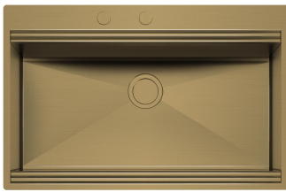
Sink Milanello Gold workstation 1034 059