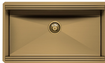
Sink Milanello Gold Workstation 1034 859