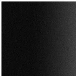
601 FT black