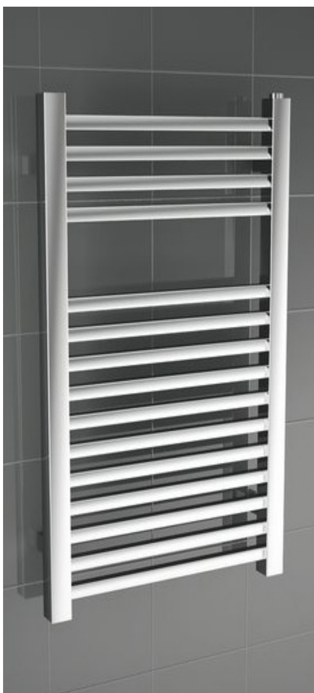
Detail of Dry Towel Radiator of 800 H with 15 tubes radiant of 22 x 22 mm section