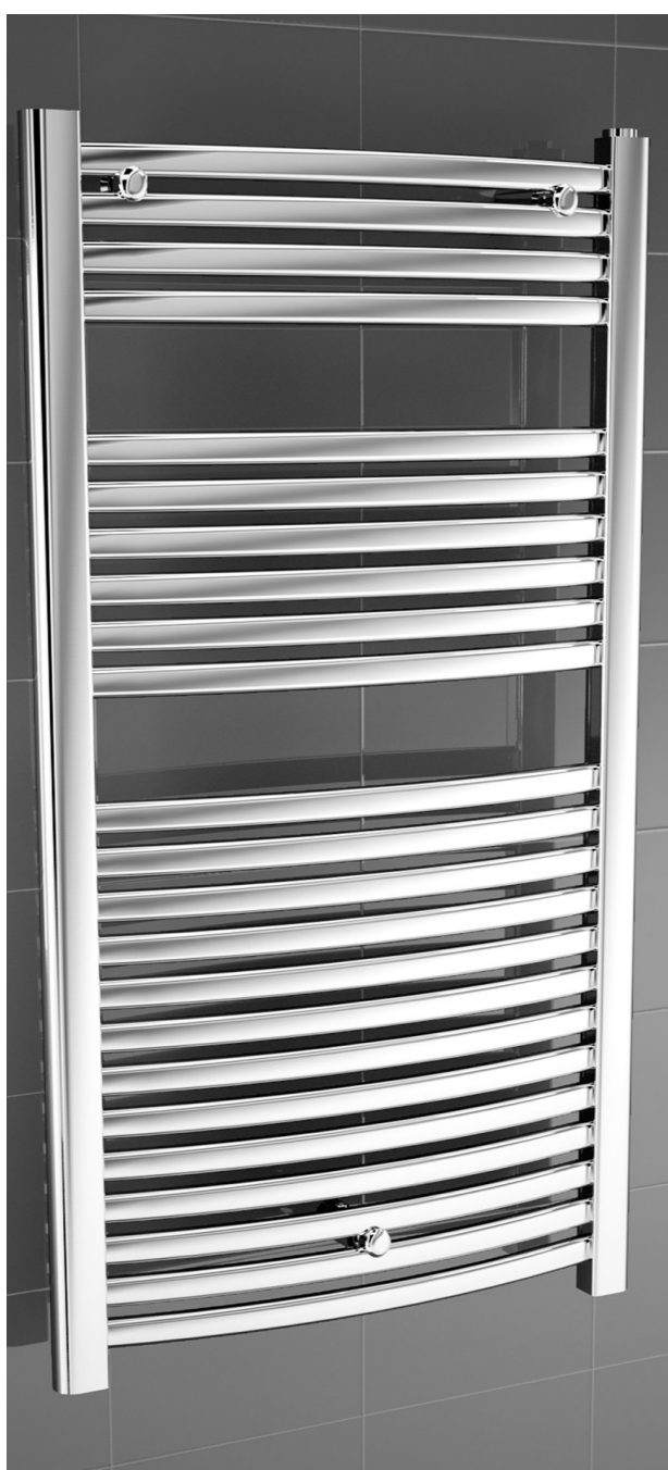
Detail of Dry Towel Radiator of 1180 H with 23 radiant tubes Ø 15 mm