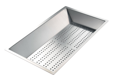
Stainless steel perforated tray 8151 000

Graters kit with ring-holder and food collection tray 8159 101