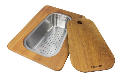
Iroko-wood chopping board with stainless steel colander 8644 042