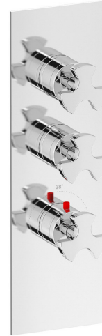
Plate and handles trimkit.