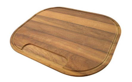
Iroko-wood chopping board 8659 112