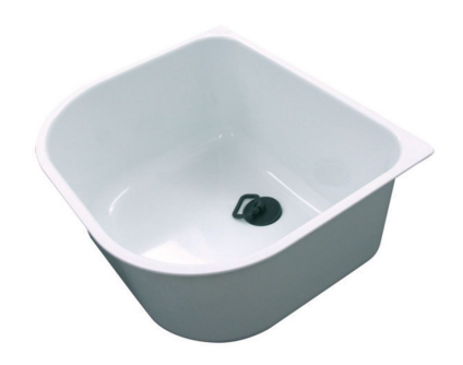
Vaschetta bianca 8152 100