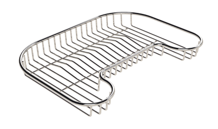
Stainless steel plate rack 8100 111