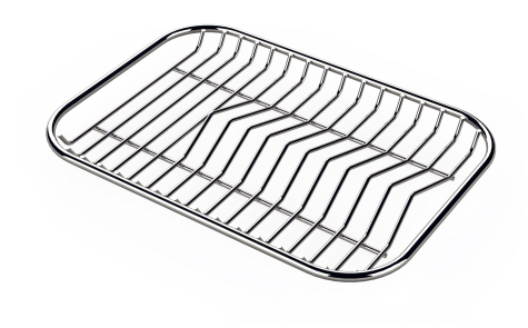
Stainless steel plate rack 8100 154