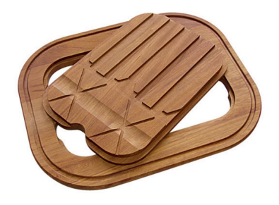
Iroko-wood twin chopping board 8644 003