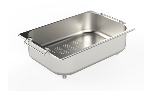
Stainless steel colander 8154 000