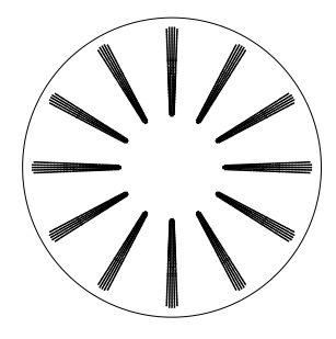
PERFORATED CITRUS PATTERN