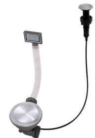
Space Push automatic waste fitting 8407 116