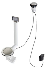
Space Light automatic waste fitting 8407 117