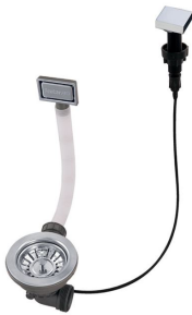
Automatic waste fitting 8407 113