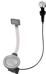
Space automatic waste fitting 8407 109