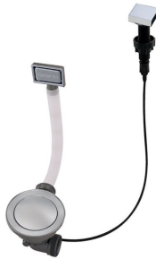
Space automatic waste fitting 8407 108