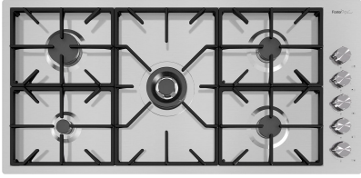
Cooker hob Foster Milano 7636 000