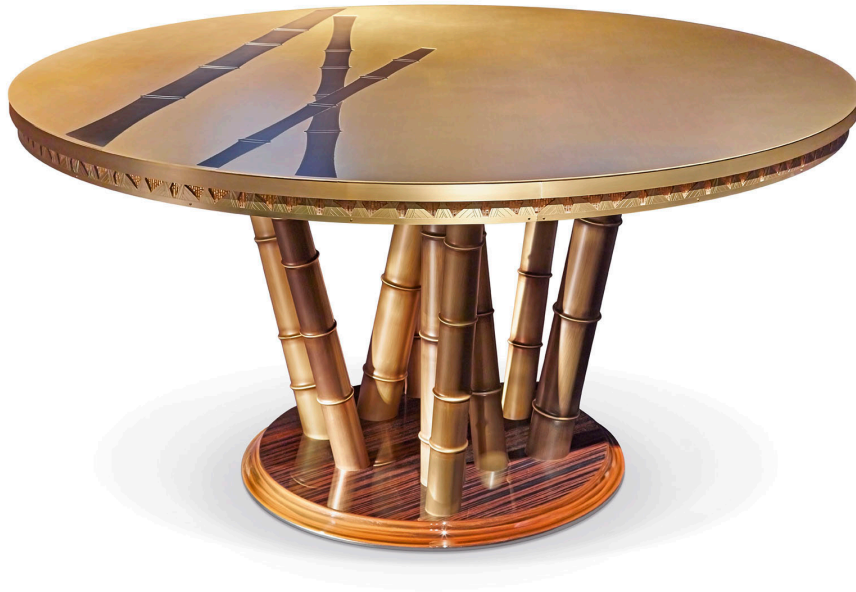
Table with two-tones bronze brass top. Decoative mosaic on top edges. Legs in bronzed brass. Glossy ebony macassar base.