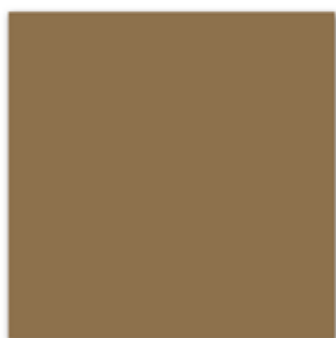
Gold / Oro REF: 62016