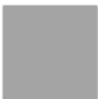
Grey/ Gris REF: 62018