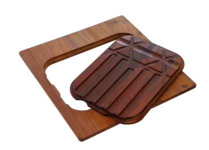
Iroko-wood twin chopping board 8644 004