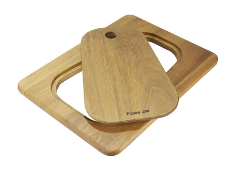
Iroko-wood sliding chopping board 8644 041