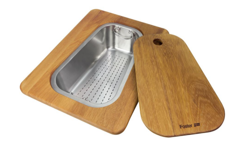
Iroko-wood chopping board with stainless steel colander 8644 042