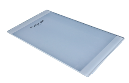
Glass chopping board 8631 300