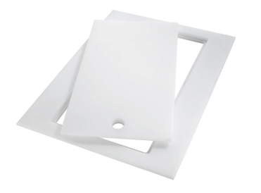
HPDE Twin chopping board 8644 101