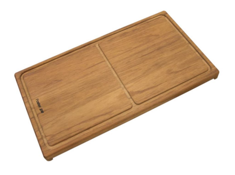
Iroko-wood sliding chopping board 8643 000