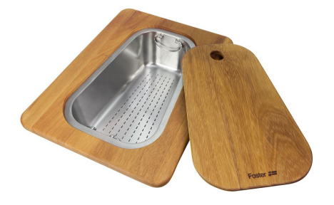
Iroko-wood chopping board with stainless steel colander 8644 042