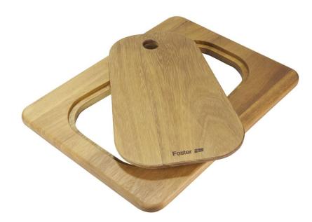
Iroko-wood sliding chopping board 8644 041