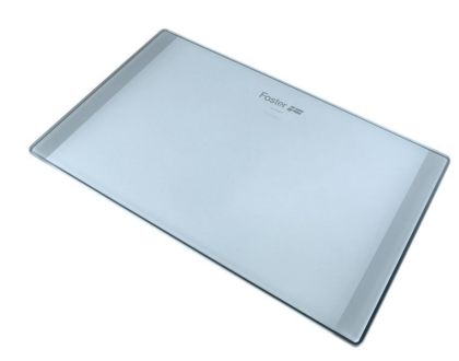
Glass chopping board 8633 300